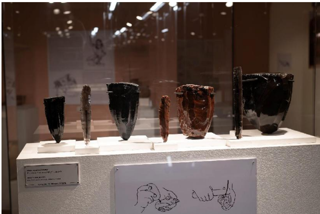
Obsidian nuclei (Neolithic, VI Mil. BC) in the museum exhibition