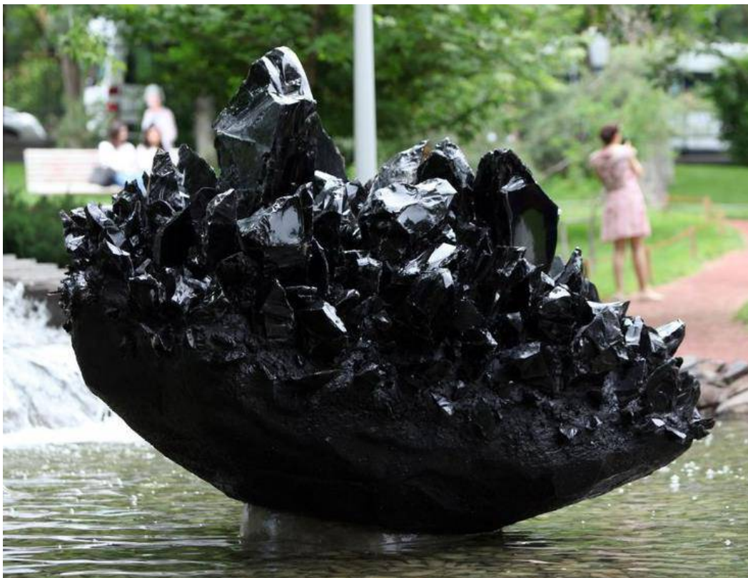
Obsidian Hearth, sculpture by Jean-Michel Othoniel (b. 1964), France, 2014, Boghossian Foundation Collection, Lovers Park, Yerevan, 143x200x220 cm

Yerevan, Armenia, 28 September – 01 October, 2026