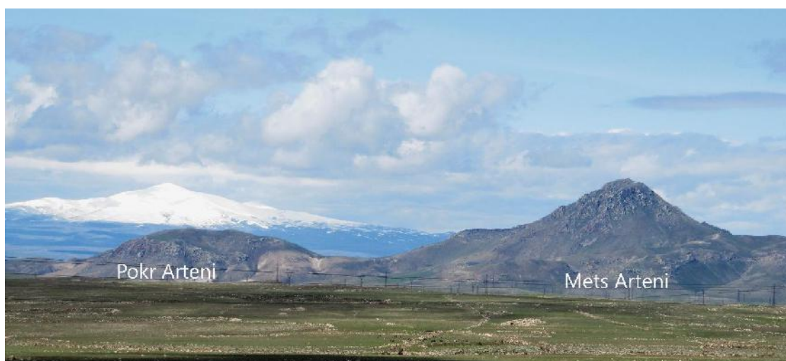
Arteni volcanic complex in Armenia, Aragats volcanic province.

Arteni is the most compound rhyolitic volcanic complex in Armenia, and it consists of two independent rhyolitic volcanoes: Mets (Big) and Pokr (Little) Arteni (2047 and 1754 m asl, respectively). Volcanic activity began with an eruption of perlite-pumice pyroclastics, followed by eruptions of detrital perlite and zonal obsidian that flowed westward and southward; shorter flows also went northward. Arteni obsidian is of high quality; "smoky quartz" of the translucent, reddish-brown, black, and other varieties are known.