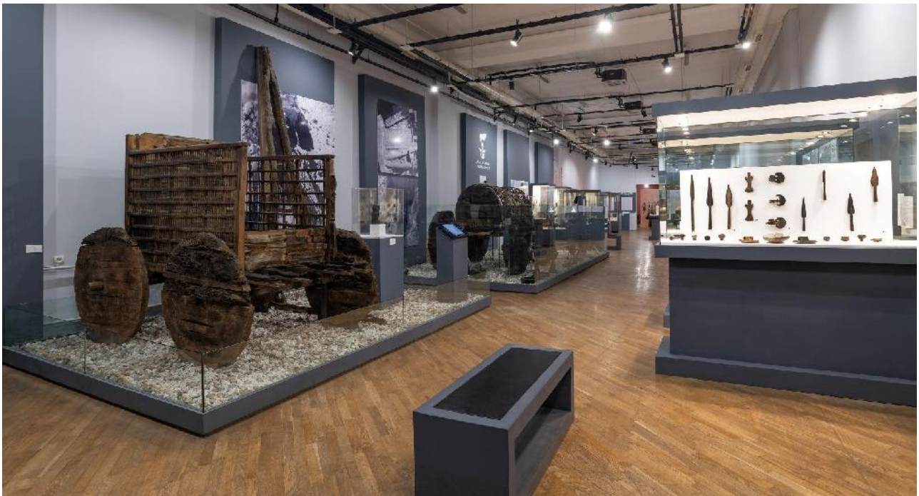
Exhibition of History Museum of Armenia