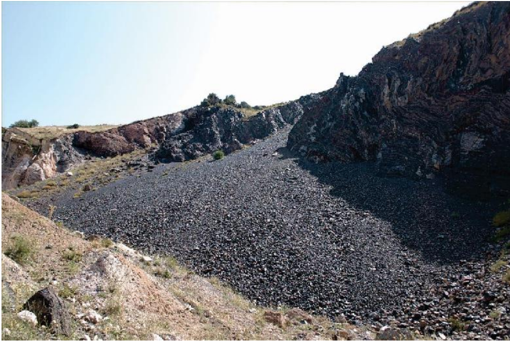
Jraber extrusive body related to the Gutansar volcanic complex. Obsidian outcrop on the Yerevan-Sevan highway