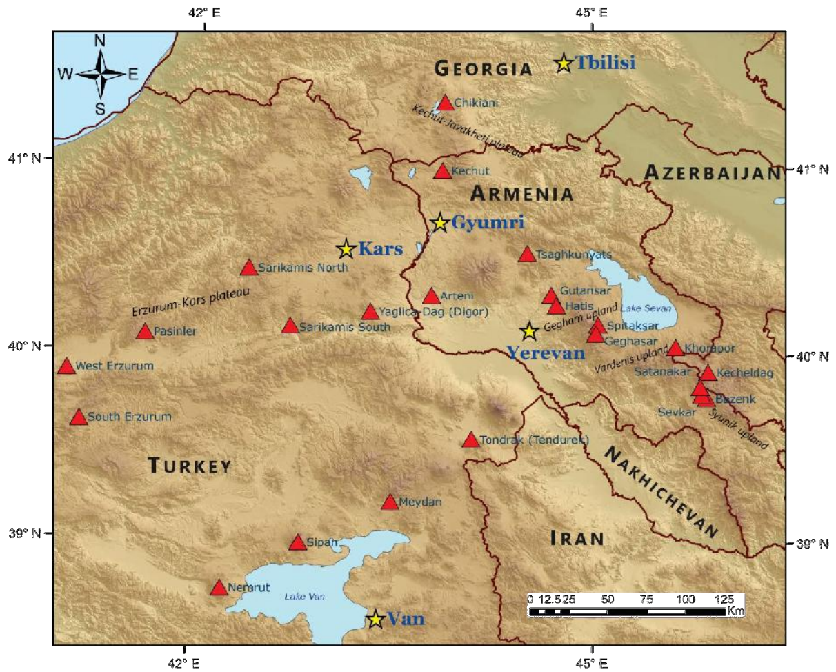
Distribution of obsidian sources in Armenia, Georgia and Eastern Turkey (after Meliksetian et al., 2024).