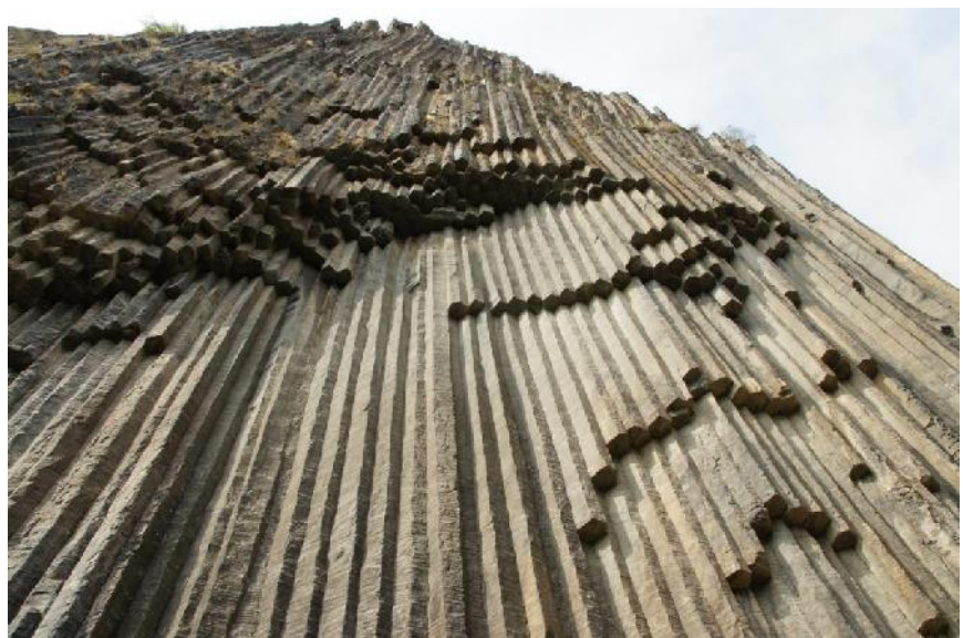
Columnar lava flow in Garni, 127 ka