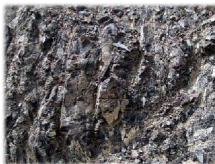
Products of explosive eruptions of rhyolite pumice and perlite pyroclastics (left). Obsidian cliff in small modern quarry across a lava flow erupted from Pokr Arteni volcano (right).