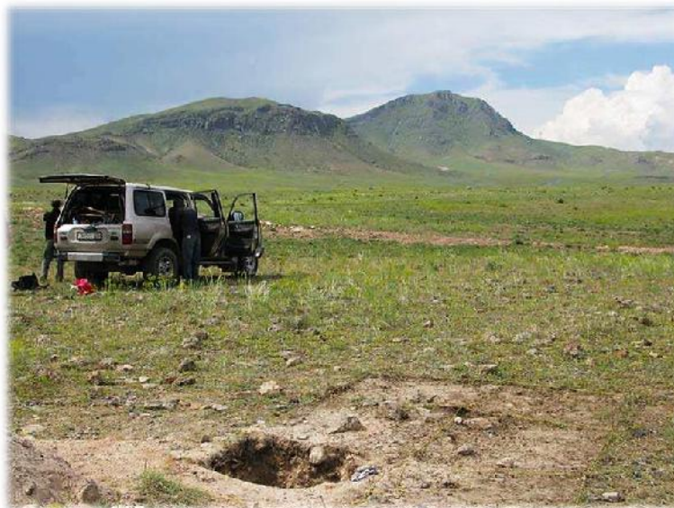
View of Barozh-12 open-air Paleolithic site and test trench. Arteni volcano is in the background.

Unidirectional-convergent and unidirectional Levallois core reduction techniques dominate in the core and flake assemblage, and retouched pieces are numerous. These are mainly retouched Levallois points and convergent and other unifacial scraper forms on Levallois blanks.