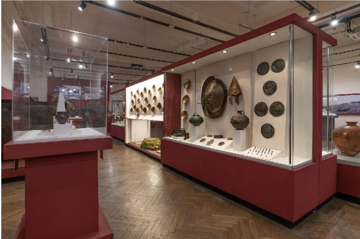
Exhibition of History Museum of Armenia