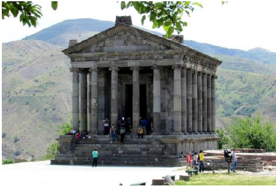
Garni Hellenistic temple