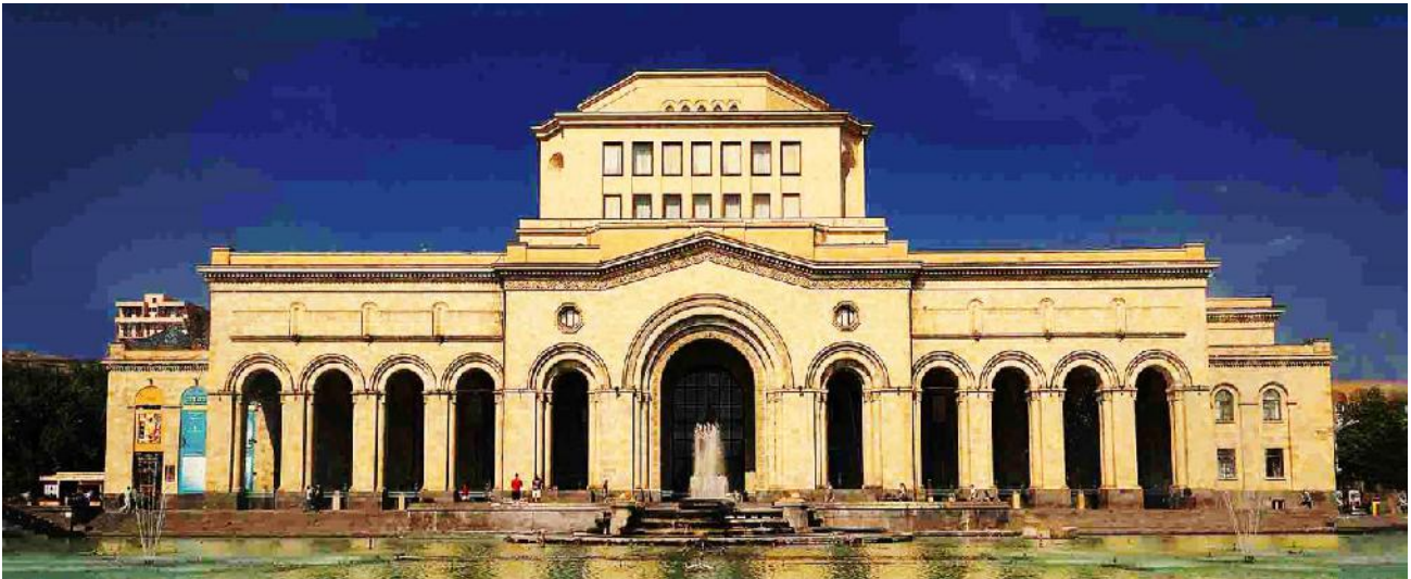
History Museum of Armenia

The History Museum of Armenia is a nationally significant cultural institution dedicated to preserving and showcasing Armenia's heritage. With a collection of over several hundreds of artifacts spanning from Paleolithic times to today, the museum serves as a bridge between the past and the future, contributing to science, education, and tourism.